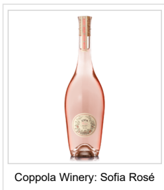
Coppola Winery: Sofia Rosé

"You know why we don't hear about famous women in history? Because the history books were written by men." – Eleanor Coppola